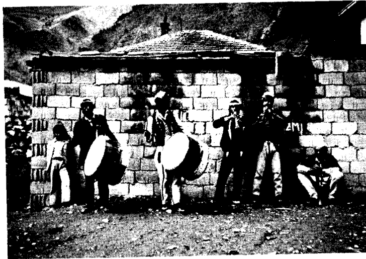
1. A band of musicians ( tajfa ) playing at a wedding. Two drummers and two shawms are at work while a substitute holds himself in readiness. The boy on the left is the son of one of the musicians. Brod 1975.