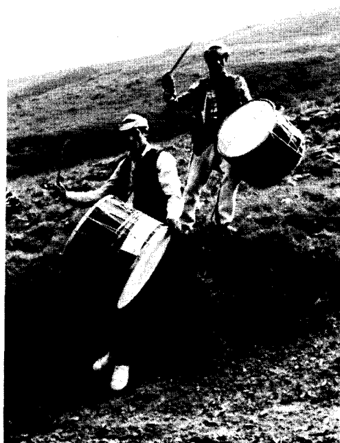
5. Drummers during the decent from the mountain Jelica to the village 28 ). Brod 1976.